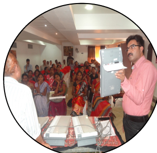
District Level workshop on EVM Awareness under SWEEP Campaign.

NGO's members of civil society and SHG members participated. We have targeted Baihar and Birsa block for this campaign. Various activities has been conducted in the campaign. We have reached more than 5000 individuals through various activities i.e. Awareness Rally, Meeting at panchayat, Poster and Banner, Information stall at market place, program at college etc.