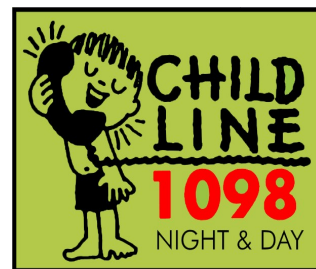
CHILDLINE Balaghat dedicated to all CHILDREN's

period organization provides all support and resources to strengthen the project in Balaghat. High impacted out-reach program done by the team. In one year project period we received ..... phone call and registered ..... cases. There was different kind of child related cases, i.e. missing, trafficked, health, education, rehabilitation, disabled, psychological etc. The team has been nicely handling the cases and serving children's who are in need. Childline Balaghat is being visible in district and coordinating with all departments. We are trying to listen and address each and every problems of child and trying to resolve their problems. In last one year we have organized more than 70 out reach program in different private and govt. school with more than 3000 children's. Through the open house we