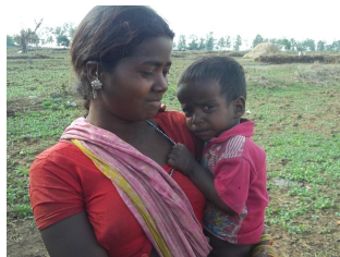
Fighting with taboos, misconception and understanding on Malnutrition.

feeding demonstration we have introduced LADDU of Gram, Gud, Peanut. More than 20 children have been treated with this laddu. Weight have been increased.