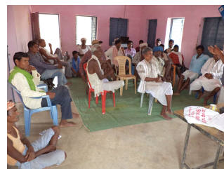
Training, Workshop and Planning for Sustainable Livelihood.

After successful implementation of different project activities. 307 families organized and start learning of horticulture crop cultivation, after looking the potential of land based crop, we have promoted Ginger, Turmeric and Potato cultivation. First year the products used by the families for consumption only but in 2nd year 80% beneficiary has been consumed and start marketing also. In first two years initiatives each family is being able to earn Rs. 3 to 5 thousand additional income. With this organic farming was promoted among the project beneficiary, different kind of low cost composting techniques has been introduced and bring in behavior. Around 50 farmers prepared low cost compost pit which they called TATIYA NADEP. This is the area where less chemical fertilizer and pesticide in practice, which needs to support and continue because market forces are coming in this area with seeds and chemical products. To promote organic farming and promotion of local seeds we have done one