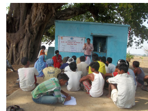
Bringing change through community participation.

the support of our donor PHF, THP and CIF and we are grateful for individual donor and members of the board for their direction and continue support.